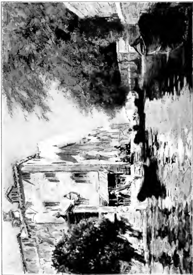
I have laid hands on a canal—the Rio Giuseppe.